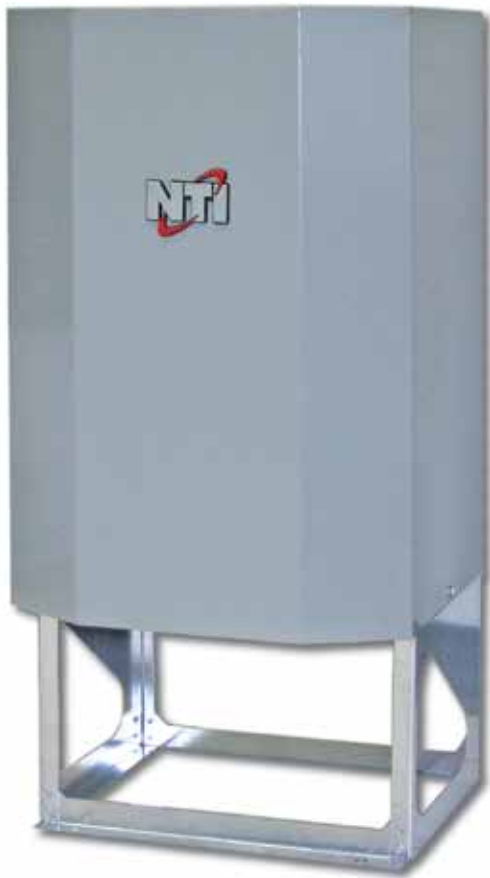
Ti-150 with optional floor stand