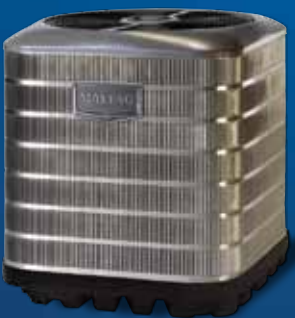
M1200 13 and 14 SEER Comfort Systems