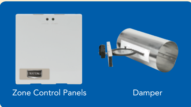
Zone Control Panels

Instead of trying to heat or cool an entire house with one thermostat, living spaces are essentially divided into separate comfort zones. Each zone has its own thermostat to set and monitor the ideal temperature.